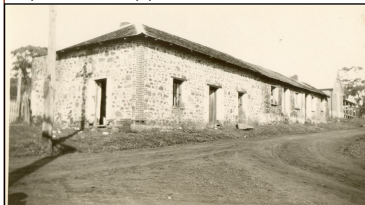
The Toodyay Convict Depot Warders Quarters were located in Fiennes Street between the Courthouse and the Masonic Hall. They were demolished in the early 1930s.

Entry is free for all Toodyay residents to both our museums.