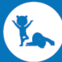
FIND A 'KIDS YOGA' YOUTUBE VIDEO