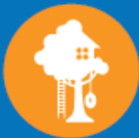
BUILD A CUBBY OR TREE HOUSE

We've listed some ideas below to get you started - try three every day: