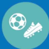
PRACTICE YOUR SOCCER SKILLS WITH DRIBBLING, KICKING AND SHOOTING