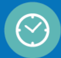
'WHAT'S THE TIME MR WOLF?' GAME