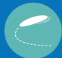
ULTIMATE FRISBEE COMPETITION

For more information on how to Exercise Right at Home, visit exerciseright.com.au