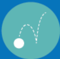
PRACTICE BOUNCING AND CATCHING BOUNCY BALLS