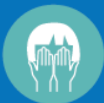
HIDE & SEEK