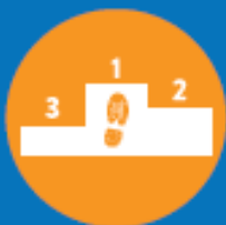
CREATE YOUR OWN KIDS BOOT CAMP WITH PRIZES