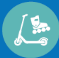
30-MINUTE SCOOTER/BIKE RIDE/ SKATEBOARD/ ROLLERBLADE