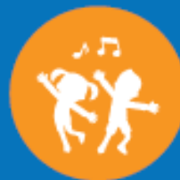
ZUMBA DANCE PARTY OR 'LEARN TO DANCE' YOUTUBE VIDEOS