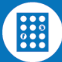
MAKE YOUR OWN TWISTER CHALLENGE