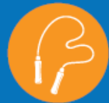
SKIPPING ROPE COMPETITIONS