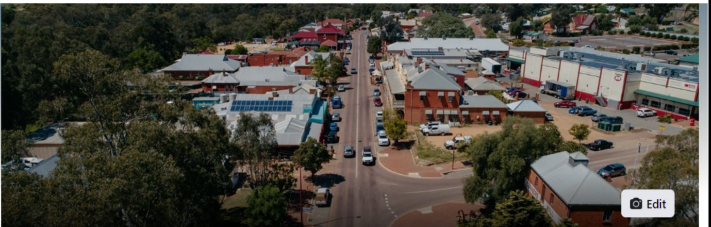
Group by Visit Toodyay

https://www.facebook.com/groups/3059840587359623