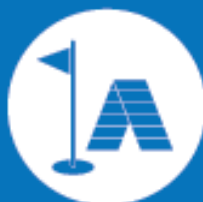
CREATE A GARDEN OBSTACLE COURSE